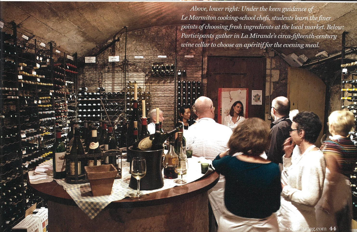
Above, lower right: Under the keen guidance of Le Marmiton cooking-school chefs, students learn the finer points of choosing fresh ingredients at the local market. Below: Participants gather in La Mirande's circa-fifteenth-century wine cellar to choose an apéritif for the evening meal.